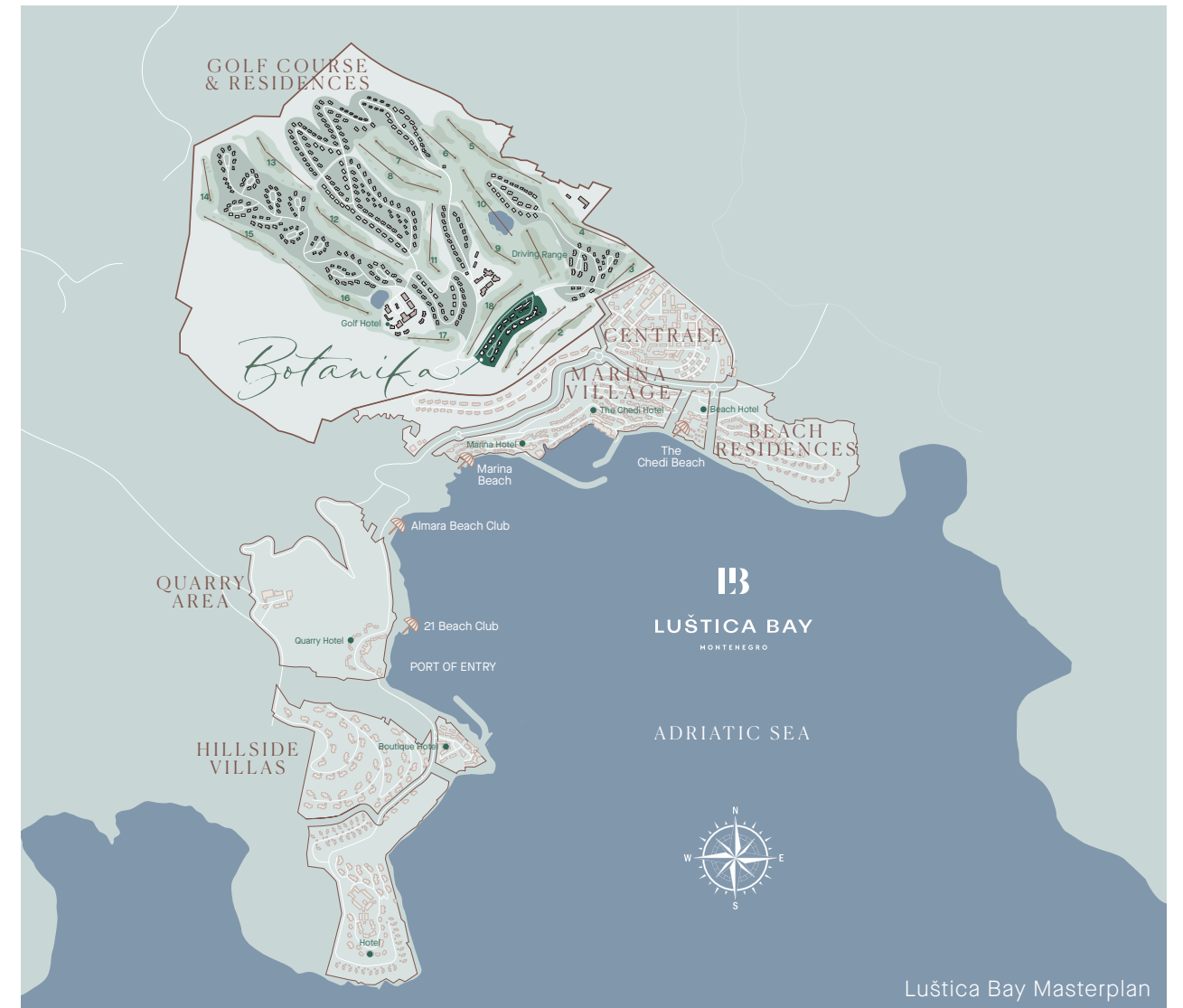
Luštica Bay Masterplan